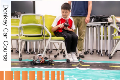
Donkey Car Course