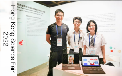
Hong Kong Science Fair 2022