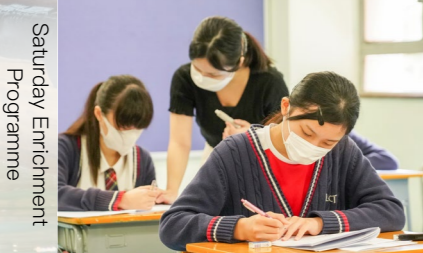
Saturday Enrichment Programme