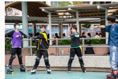
Other Learning Experience Programme