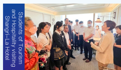
Students of Tourism and Hospitality visiting Shangri-La Hotel

The Admissions and Careers Guidance team collaborates with academic departments to organize thematic experiential activities and talks on further studies and career options, such as sports and fitness, hospitality and tourism, and entrepreneurship. This allows students to explore their interests and plans for the future.