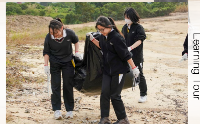
Diamond Jubilee Learning Tour