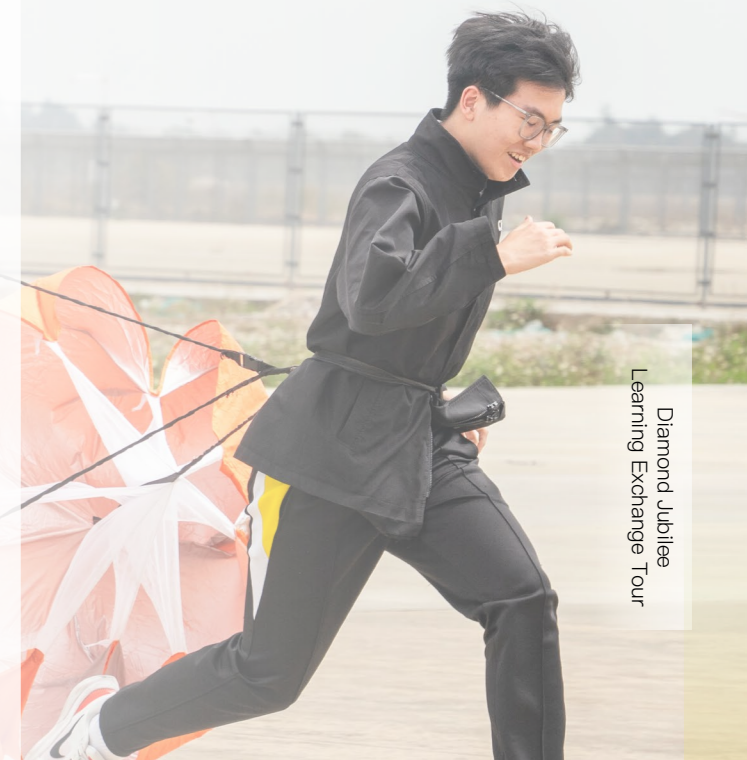
Diamond Jubilee Learning Exchange Tour

The school organized the "60th Anniversary Celebration Learning Exchange Tour" to celebrate the 60th anniversary of the school's founding. The activities integrated elements of STEAM education, discipline training, environmental conservation, animal welfare, service experience, cultural heritage, and social issues. Through these learning activities, the school aims to cultivate students' social and civic responsibilities, guide them to reflect on relevant issues, enhance their learning effectiveness, and shape their correct values.