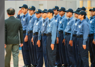
Enhanced Smart Teen Project