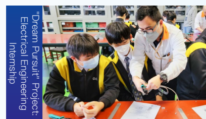
"Dream Pursuit" Project: Electrical Engineering Internship

The Admissions and Careers Guidance team, together with form teachers and various school units, form a cross-departmental counselling group to provide early intervention. They assist students in establishing their academic and career directions through: