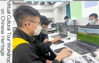
Virtual Cultural Tour Workshop on Chinese Heritage