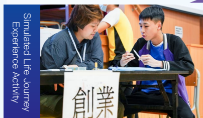
Simulated Life Journey Experience Activity

We implement a comprehensive and coherent career planning programme throughout students' 6-year secondary education. This includes self-understanding, aptitude analysis, career exploration, workplace visits, internship experience, and exposure to higher education options, with the aim of helping students plan their future early on.