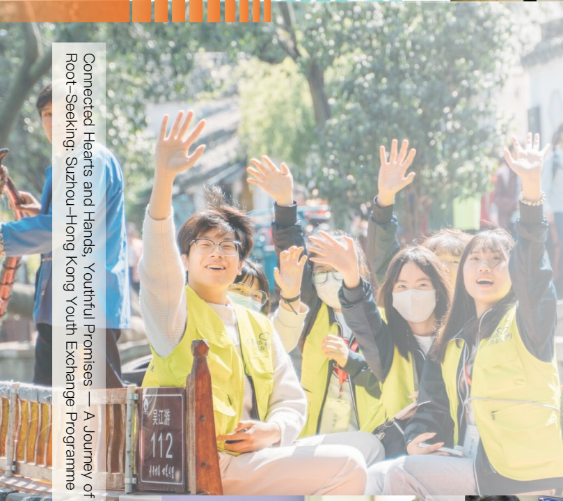
Connected Hearts and Hands, Youthful Promises — A Journey of Root-Seeking: Suzhou-Hong Kong Youth Exchange Programme

The school organizes "gifted" classes in Chinese, English, and Mathematics every Saturday, inviting the top 30 students (including S6) to participate. The curriculum is diverse, including academic enhancement, leadership development, and national education field trips. Over 110 students participate in the "CLCT Stars" program, with an attendance rate exceeding 95%, effectively enhancing the learning atmosphere on campus.