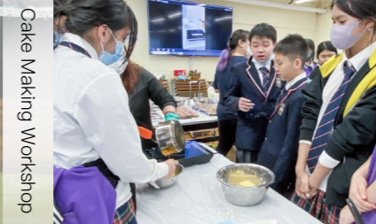
Cake Making Workshop