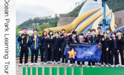
Ocean Park Learning Tour