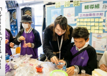
Healing Handicraft Workshop