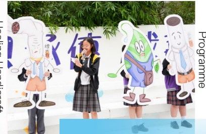
Smoke-free Elite Teens Programme